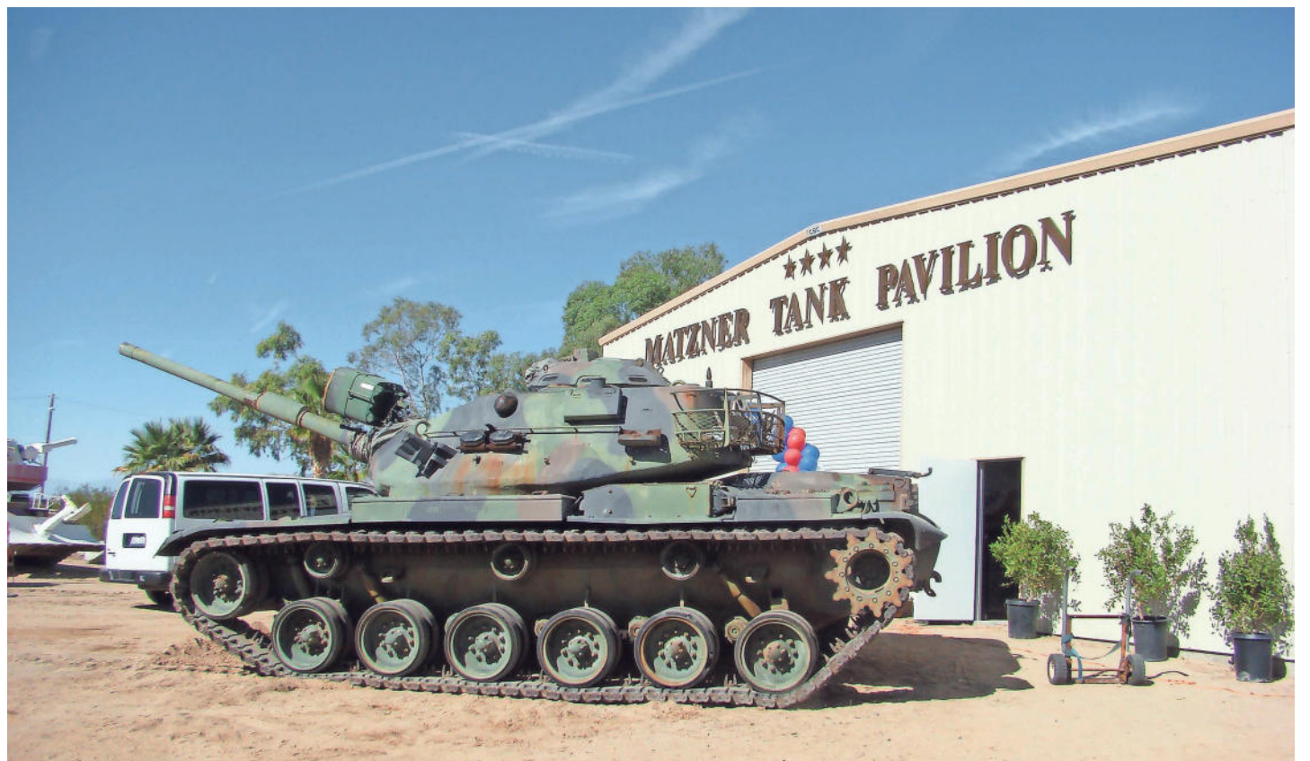
A motorized tank sits in front of the Matzner Tank Pavilion after the ceremony that opened the Pavilion to the public for the first time.